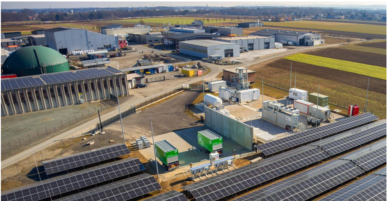
Figure 2: bird-view of the P2G-site

Looking back at the timeline we see a quick and straight forward authority engineering process which lasted from March 2021 until April 2022. The construction on site started in April 2022 and was completed after only six months already in September 2022. Start-up followed and the commissioning was completed in March 2023.