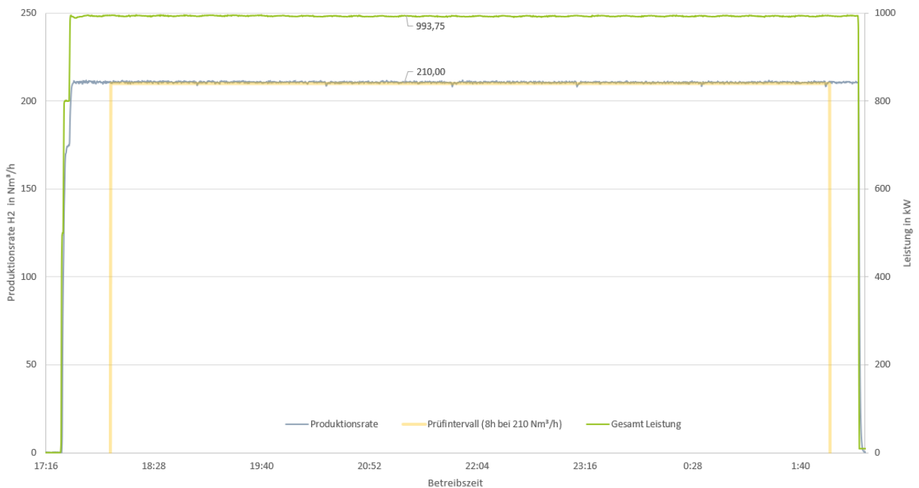
Figure 3: Consumed electric power and hydrogen production during test-run